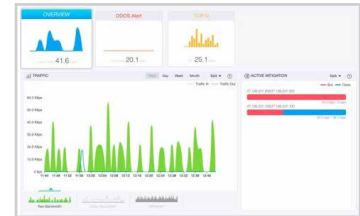
Cleaned Traffic Report