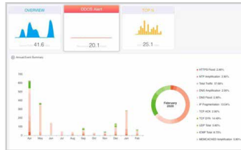
DDoS Events Details & Summary