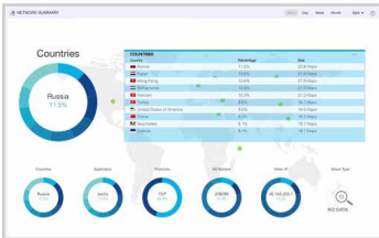
Network Status Summary